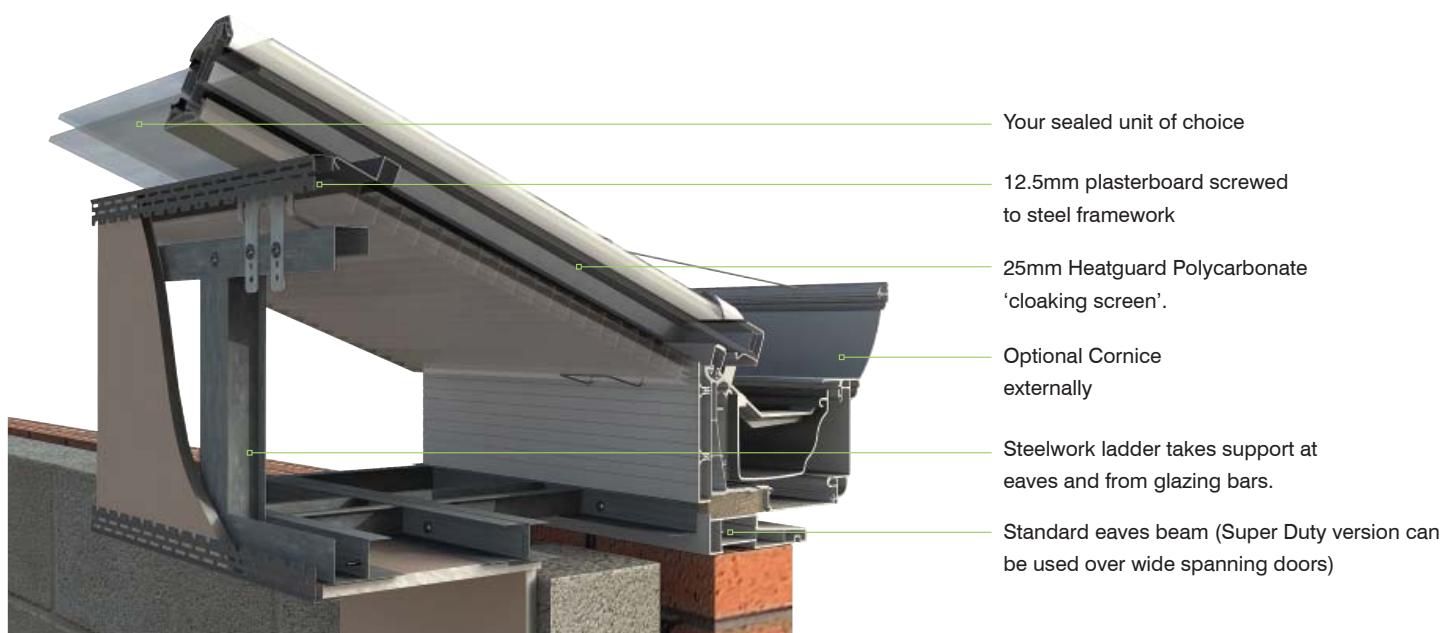
▲ Cornice and LivingRoom on brick columns